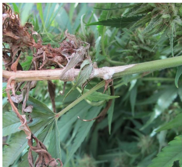
Image 5. Sclerotinia sclerotiorum on hemp stem. Alburgh, VT.

but were not statistically similar to Cosmic. AC/DC, Alexa, Apollo, Boax, Cherry Blossom, Dave’s Haze, Eighty-Eight, Otakarek, Painted Lady, Skipper, VT Cherry, and Wulf were not infected with gray mold. White mold was also present, however, it did not appear to be as prevalent or severe as gray mold within