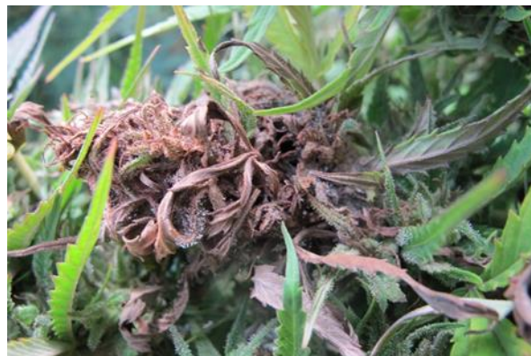
Image 4. Botrytis cinerea in hemp. Alburgh, VT.

The two diseases, gray mold ( Botrytis cinerea ) (Image 4) and white mold ( Sclerotinia sclerotiorum ) (Image 5), were observed within the trial (Table 6). Gray mold was evaluated by the number of infected colas and white mold by the number of infected stems per plant prior to harvest. Disease present on plants was also rated for severity on a 1-5 scale, 1 being least severe and 5 being most severe. Within this study, Cosmic appeared to have the highest incidence of gray mold with an average of 5.5 infected colas per plant as well as the greatest severity at 2.75. Other varieties also experienced higher incidence of infection for gray mold including Ceiba, RN13, and Suzy Q,