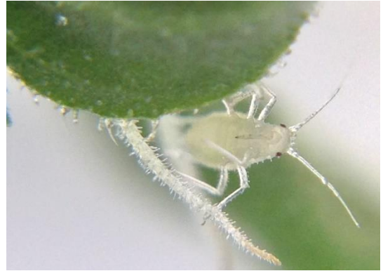
Image 3. Hemp aphid on underside of leaf. Alburgh, VT.

Arthropod pests were scouted towards the end of the growing season from 13-Sep until 10-Oct (Table 5). European corn borers, or other stem boring insects, were observed in four hemp varieties including AC/DC, Cherry Wine, Painted Lady, and Wulf. While the differences between varieties was not statistically significant, host specific hemp borers or crossover European corn borers could have the potential for causing crop losses depending on the location of entry along the stem and number of generations within a given year. During the observed scouting period, VT Cherry had the lowest populations of aphids (Image 3) at 0.17 aphids per leaf alongside top performers Alexa, Suzy Q, Dave’s Haze, Cosmic, Cherry Blossom, River Rock, AC/DC, and Wulf. Cherry Wine had the greatest aphid populations at 16.9 aphids per leaf. Other observed insects included tarnished plant bugs, minute pirate bugs, flea beetles, and lady bugs among others. High populations of aphids led to similarly high population of lady bugs in various growth stages throughout the observation period.