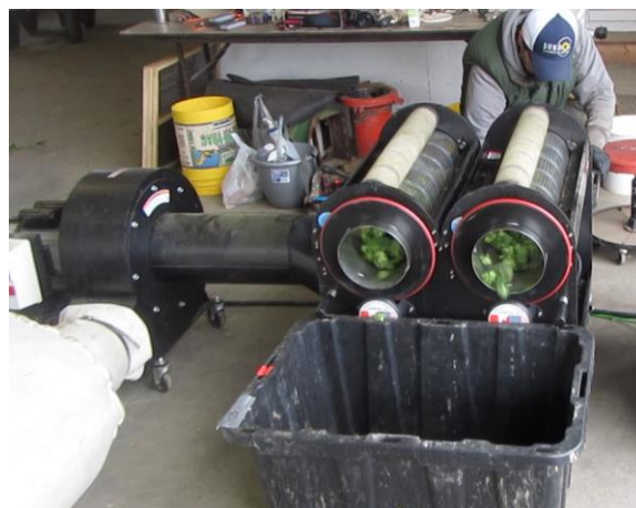
Image 2. Centurion Pro Gladiator Trimmer (Maple Ridge, BC, Canada)

For each plant harvested the whole plant weight was recorded. Plants harvested prior to 22-Oct were processed entirely by hand. Plants harvested after 22-Oct were broken down into smaller branched sections and larger “fan” or “sun” leaves were removed by hand, while smaller leaves were left attached since they subtend from the flower bract. Remaining stems were then bucked using the Munch Machine Mother